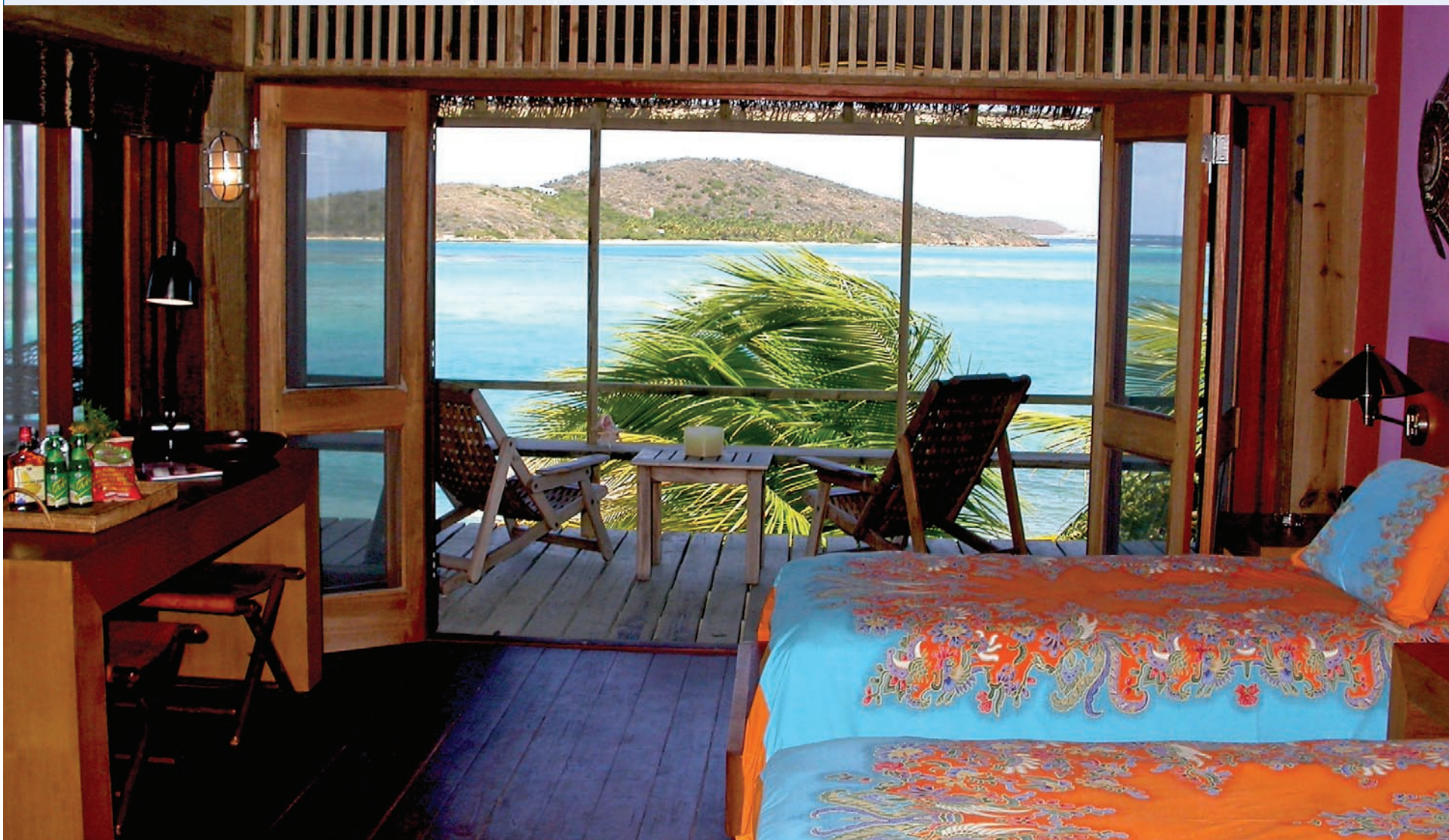
Beachfront Villa, view intact!