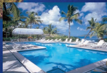
Or just relax.

Bitter End's signature vacation package is the Admiral's Package. Admiral's Packages start at 7 nights and are the best way to experience all of the resort's amenities and activities as well as explore the British Virgin Islands.