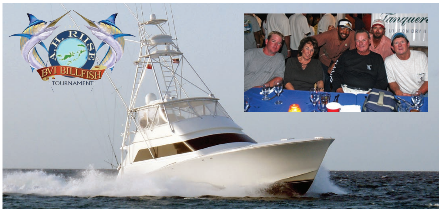
Black Gold and her team, inset.

The dates for next year's event at Bitter End will be July 19-July 23, 2008, but there's fishing that happens year round at Bitter End!