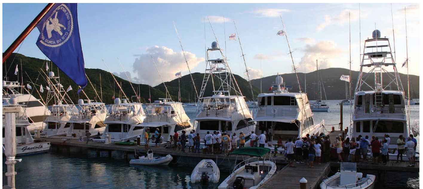
Boat christening during Viking Rendezvous 2007.