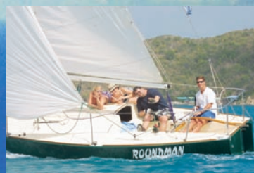
Take up sailing.