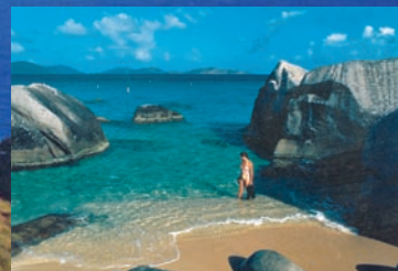
Visit the Baths